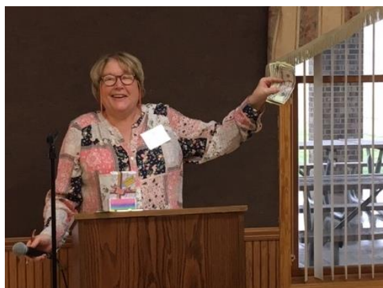
Charlotte won the 50/50 drawing. Let the party begin!