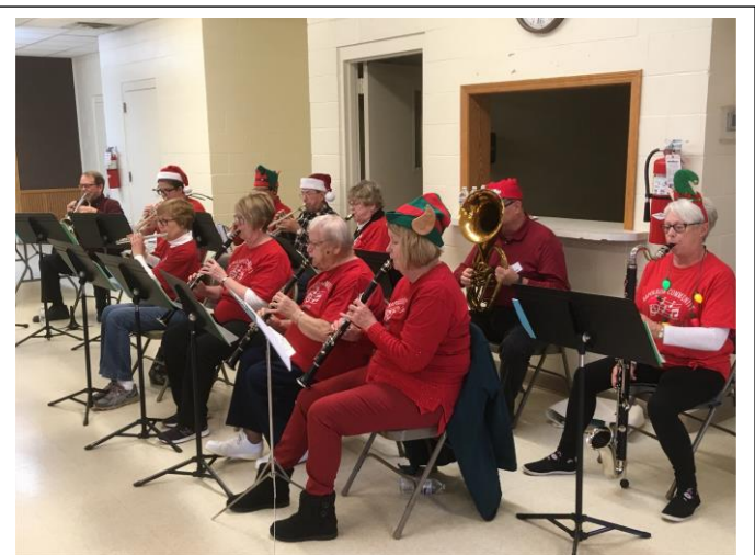
The Elf Band Returns!