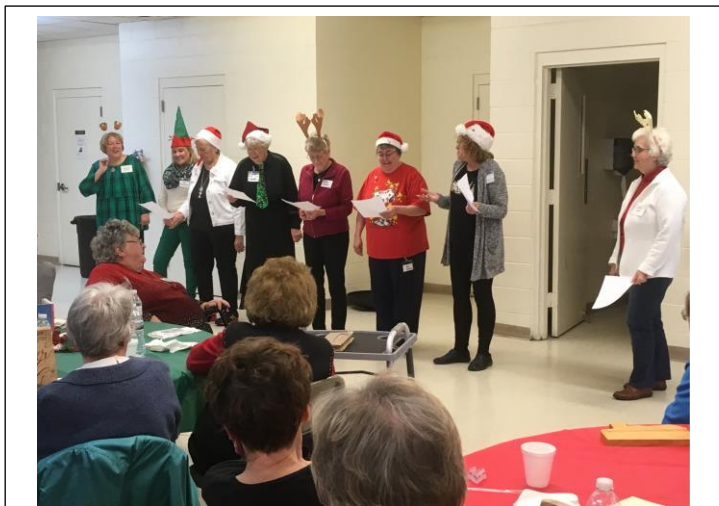
The 12 Days of Christmas – Teacher Version – Was performed with flair!